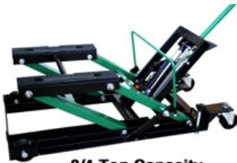
3/4 Ton Capacity Motorcycle/ATV Jack